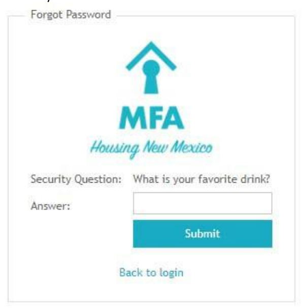
Figure A.2 – Forgot Password

If you have forgotten your password, you need to enter in your username and then click on the "Forgot Password" link. Then you will be taken to a screen that will present you with the security question that you chose when you first registered. Enter in the answer, also which you entered when you first registered and you will receive an email with a temporary password to access your account.