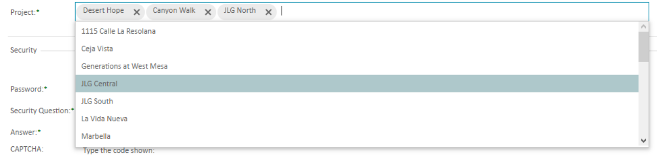
Figure A.4 - Project Selection

Click on the project section to see a dropdown list of all of the available projects to upload to. Clicking on a project will add them to the list and you will be able to add as many as you require.